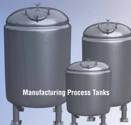
Manufacturing Process Tanks